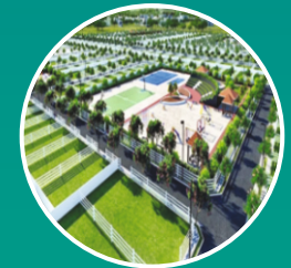
READY TO MOVE PLOTS