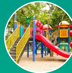
KID'S PLAY GROUND